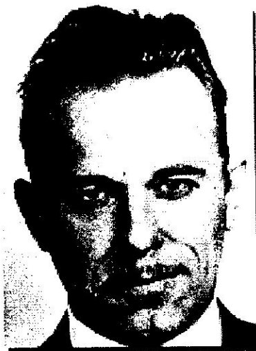
John Dillinger (1903 – 1934)

John Dillinger became infamous after committing a series of violent crimes in the Midwestern United States during 1933 and 1934. In less than a year, Dillinger and his gang killed 10 men, wounded 7 other men, robbed numerous banks and police arsenals, and committed 3 jail breaks.